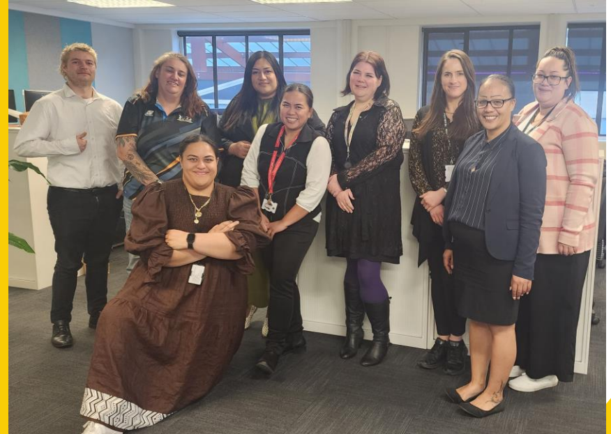
Image of the Rotorua YSSU team