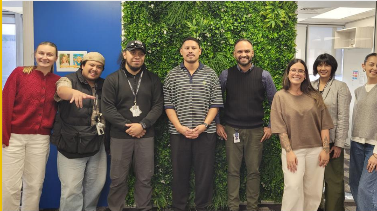
The Youthline team

MINISTRY OF SOCIAL DEVELOPMENT TE MANATŪ WHAKAHIATO ORA