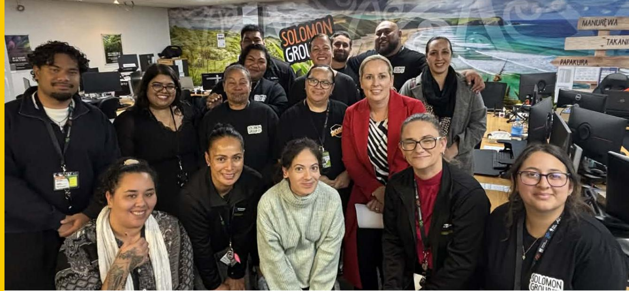
Above: The Solomon Group Auckland team Below: Ngāti Kahu Social and Health Services

MINISTRY OF SOCIAL DEVELOPMENT TE MANATŪ WHAKAHIATO ORA